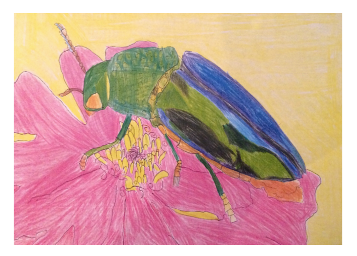
High-quality work from the EL Education second-grade curriculum module: The Secret World of Pollination.

With the guidance of EL Education coaches, leaders at Centennial worked to create a culture in which students would love learning and find meaning and purpose in the work they do in school. To build consistency in instruction