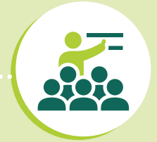
Teaching research skills

59% of middle and high school librarians report a lack of support from teachers when it comes to information literacy (IL).